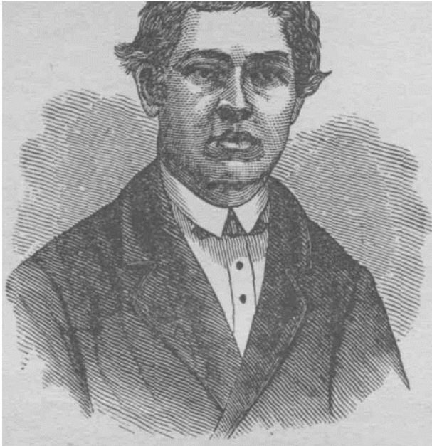
James A Garfield, at the Age of 16.